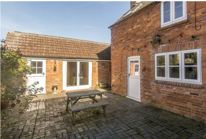
Annexe & Courtyard