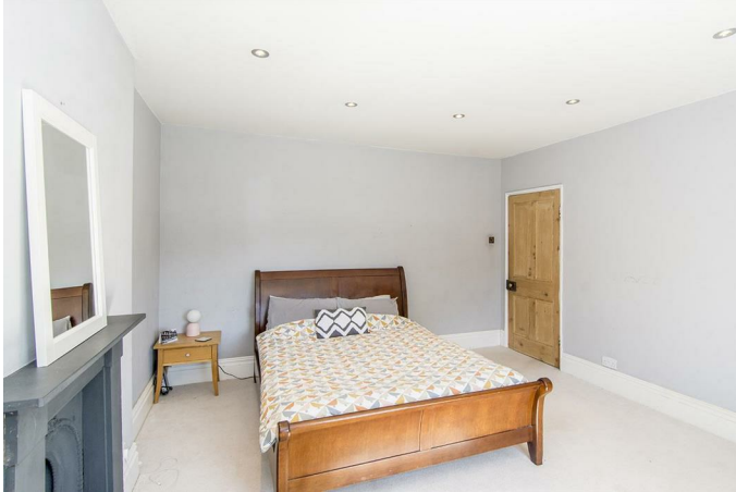
Bedroom One 15'7" x 13'1" (4.75m x 3.99m)

A double bedroom with a sash window to the front aspect. Cast iron fireplace. Radiator set into a bespoke decorative cabinet.