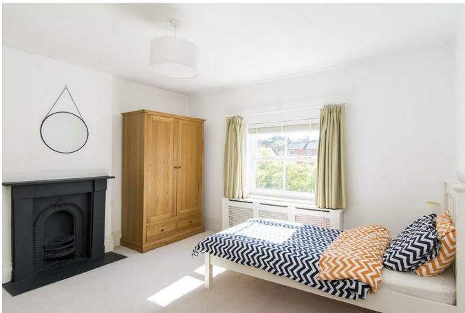
Bedroom Two 13'2" x 12'4" (4.01m x 3.76m)

A double bedroom with a sash window to the front aspect. Cast iron fireplace. Radiator set into a bespoke decorative cabinet. Two storage cupboards.