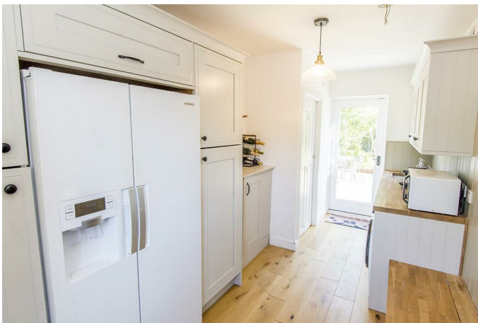
Utility Room 15'1" x 8' (4.60m x 2.44m)

Fitted with a range of cabinets with oak block surfaces. Space and plumbing for a washing machine, American Fridge freezer and tumble dryer. The oil central heating boiler is set into a cupboard. Oak flooring. A stable door opens into the courtyard and a further door gives access to the garden.