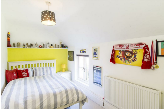
Bedroom Four 13' 10" x 6'10" (3.96m 3.05m x 2.08m)

A double bedroom with a window overlooking the garden. Radiator.