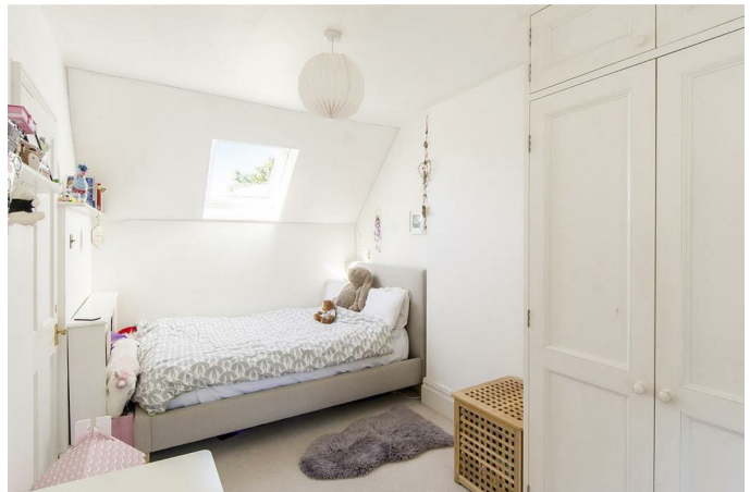
Bedroom Three 15'3" x 8'2" (4.65m x 2.49m)

A double bedroom with a window overlooking the garden and a Velux roof window. Radiator set into a bespoke decorative cabinet.