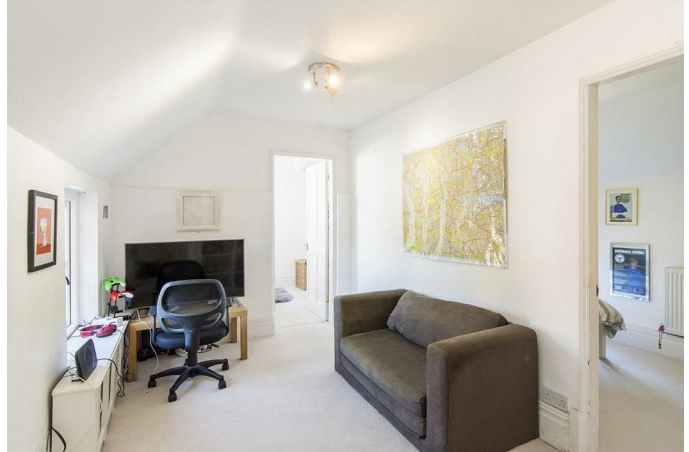
Snug 13'9" x 8' (4.19m x 2.44m)

Situated between bedrooms three and four with a window to the side aspect ,tv point and radiator.