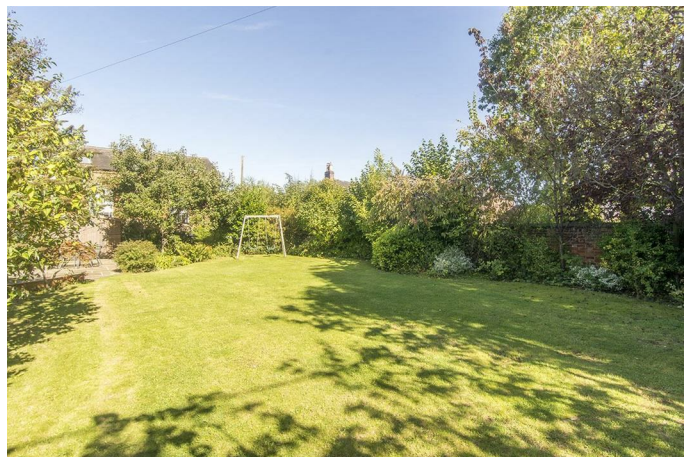
Garden Picture Two

The walled garden is mainly laid to lawn with well stocked shrub borders and mature trees. There is an extensive paved patio seating area which is the ideal spot to enjoy al fresco dining in the summer months. There is also a courtyard garden which has a set of double timber gates and is perfect for having a Barbeque.