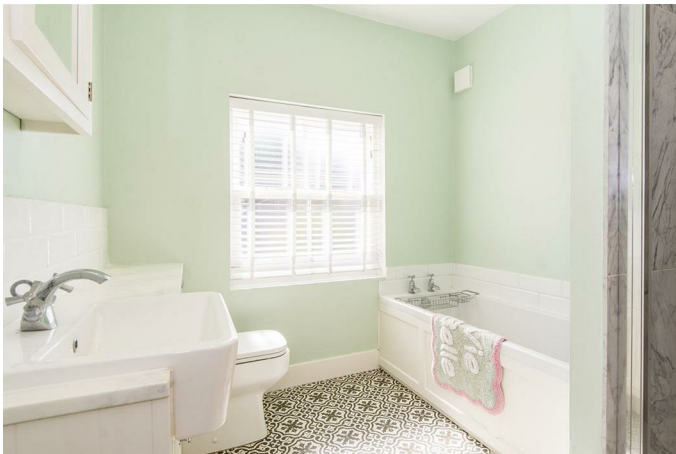
Bathroom 8' x 7'8" (2.44m x 2.34m)

Fitted with a back to wall WC. Hand wash basin set onto a bespoke vanity unit. Bath and separate shower enclosure with bi-folding doors. Chrome heated towel rail. Ceramic wall and floor tiles. Opaque window to the front aspect.